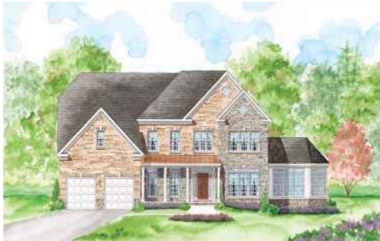
The Garrett 05GA96 at Nottingham Acres